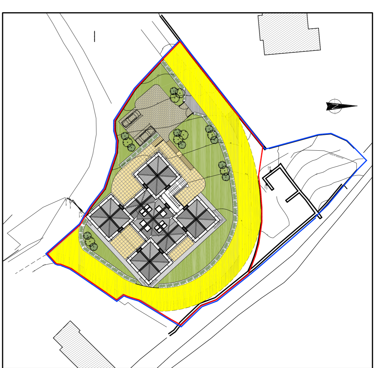
SITE PLAN @ 1:500 SHOWING RIGHT OF WAY & WAYLEAVE IN YELLOW

THIS DRAWING HAS BEEN PREPARED FOR THE PURPOSE OF A PLANNING APPLICATION ONLY. IT IS NOT A BUILDING COMPLIANCE WORKING OR CONSTRUCTION DRAWING AND SHOULD NOT BE CONSIDERED AS SUCH. THE COPYRIGHT OF THIS DRAWING IS VESTED IN THE ARCHITECTS AND IT MAY NOT BE COPIED OR REPRODUCED WITHOUT THEIR WRITTEN CONSENT